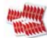
WA10 Red adhesive reflector strips. Pc/pack 24