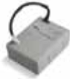
PS124 24 V battery with integrated battery charger. Pc/pack 1